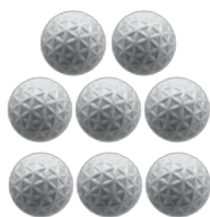
8 POWER STRIKE® ROUNDS